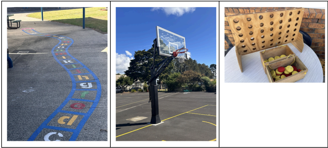
Pictures show: Picnic tables, Umbrellas, Painted Games around the school, Basketball hoops and Wooden outside games such as Connect 4.